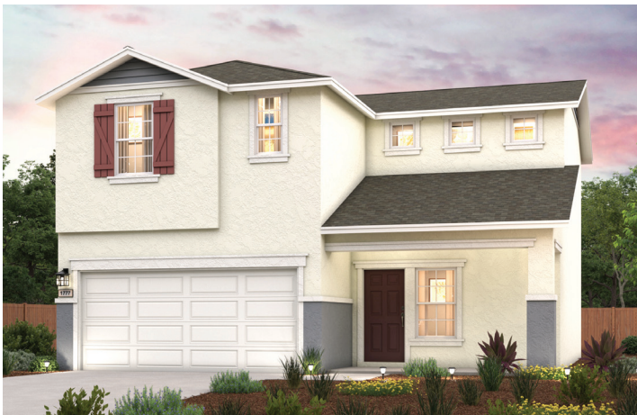
ELEVATION C - COTTAGE